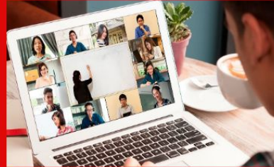
Faculty Led Virtual

Cursa materias en Universidades extranjeras y revalidalas en tu plan de estudios UPAEP