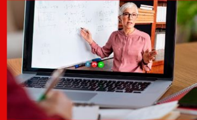
Doble Grado Online

Cursa grupalmente con compañeros de UPAEP un programa online en Universidades extranjeras